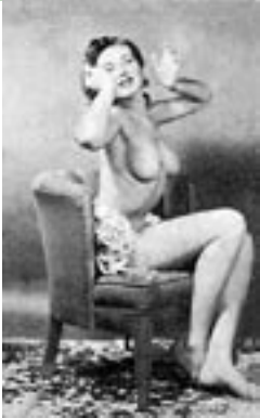
"The Disc Girl"